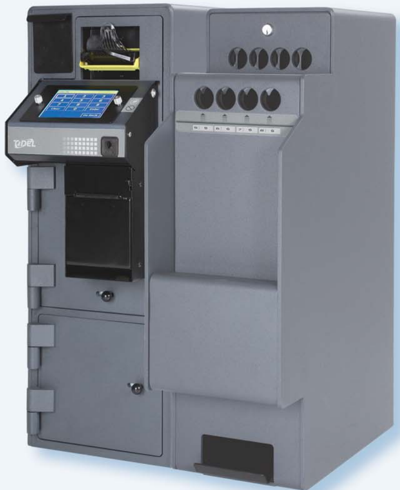
Shown with single note validator (dual available)