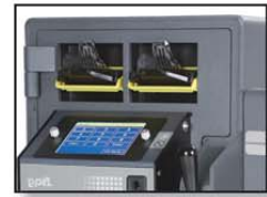
Sentinel Tube Vend with dual note validators